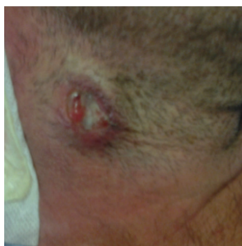
Figure 2. Cervical lymph node biopsy wound on day +90 with purulent suppuration.