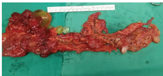
Figure 4. Surgical piece of the omentum.

The pathological anatomy indicates benign multicystic peritoneal mesothelioma. It was decided to convert the surgery to a laparotomy with omentectomy and ablation of all of the peritoneal implants without residual macroscopic tumours (Figure 4). After 1 year of monitoring, the patient is asymptomatic and free of illness at the present time.