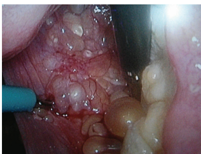
Figure 1. Laparoscopic image of implants in the Douglas pouch.

Here, we present the clinical case of a 35-year-old woman who came to our centre as a referral from her gynaecologist following the detection of findings suggesting peritoneal carcinomatosis of probable gynaecological origin during a routine gynaecological examination. The patient had no personal or family history of interest, was asymptomatic, and the gynaecological examination was normal. The peritoneal markers were negative. The computerised axial tomography (CAT) scan and magnetic resonance imaging (MRI) showed several small hypodense peripheral lesions, which suggested mucinous implants at the level of the omentum, with attachment to the liver and between intestinal loops. Ascites with septations of probable mucinous origin were also observed. The appearance of internal genital structures showed no findings of interest. An exploratory laparoscopy was performed, in which multiple cysts in the form of 'a bunch of grapes' were observed occupying the omentum (Figures 1, 2 and 3). Multiple biopsies were taken during surgery for further study.