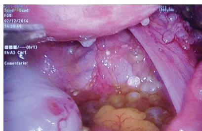
Figure 2. Laparoscopic image of multiple peritoneal implants in the Douglas pouch.