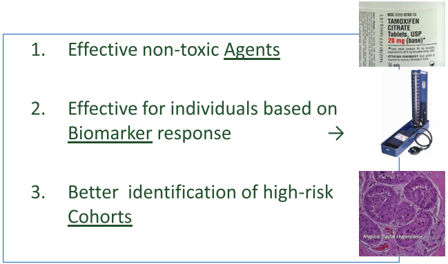
Figure 2. Key elements for cancer prevention: the ABC paradigm. (From De Censi A, Discussion abstract LBA504, ASCO June 5, 2011 [51].)

Two important types of risk factors play a role from the preventive therapy perspective: risk factors for the disease in question and factors for predicting the risk of side effects of a particular preventive therapy. The relative importance of these is influenced by the spectrum of cancers that could be prevented. For example, aspirin has preventive effects in a range of different cancers [48, 53], so that identification of high-risk individuals is not only difficult, but also not so necessary. On the other hand, aspirin's side effects are severe only in a small proportion of individuals [54] so that the ability to reliably identify such individuals and not offer aspirin to them becomes more important for improving the overall benefit-harm profile of the drug for cancer prevention. In contrast, the benefits of endocrine agents are expected only for breast cancer, and a key priority is to better identify women at high risk of developing this specific disease.