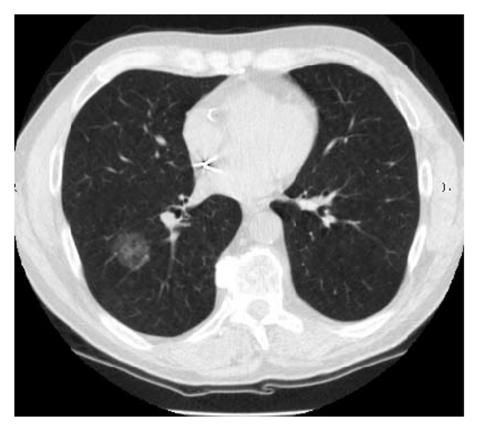
Figure 4: This is a non-small-cell lung cancer.

They are most difficult to interpret for radiologists [3].