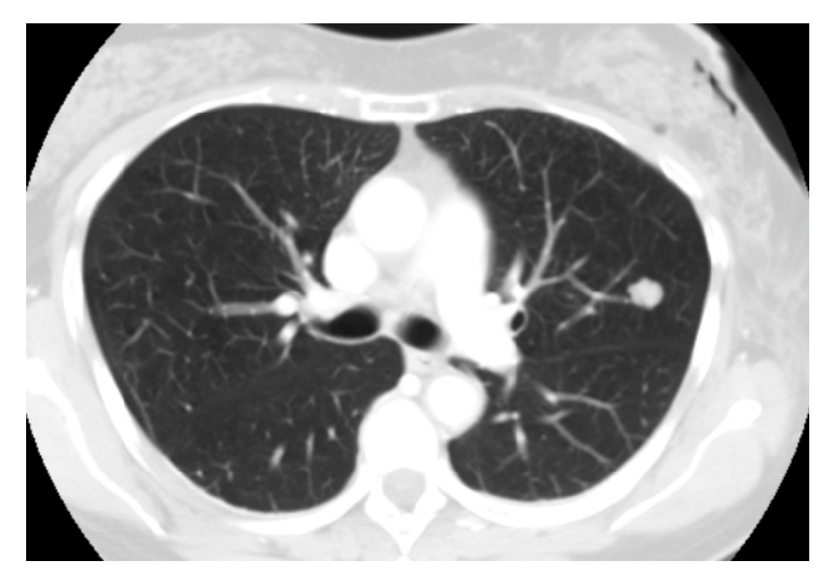
Figure 2: A solid nodule in the upper left lobe with regular, well-defined margins. This is a lung amartoma.

This is a solid nodule with homogenous soft-tissue attenuation and well-defined margins with normal parenchyma.