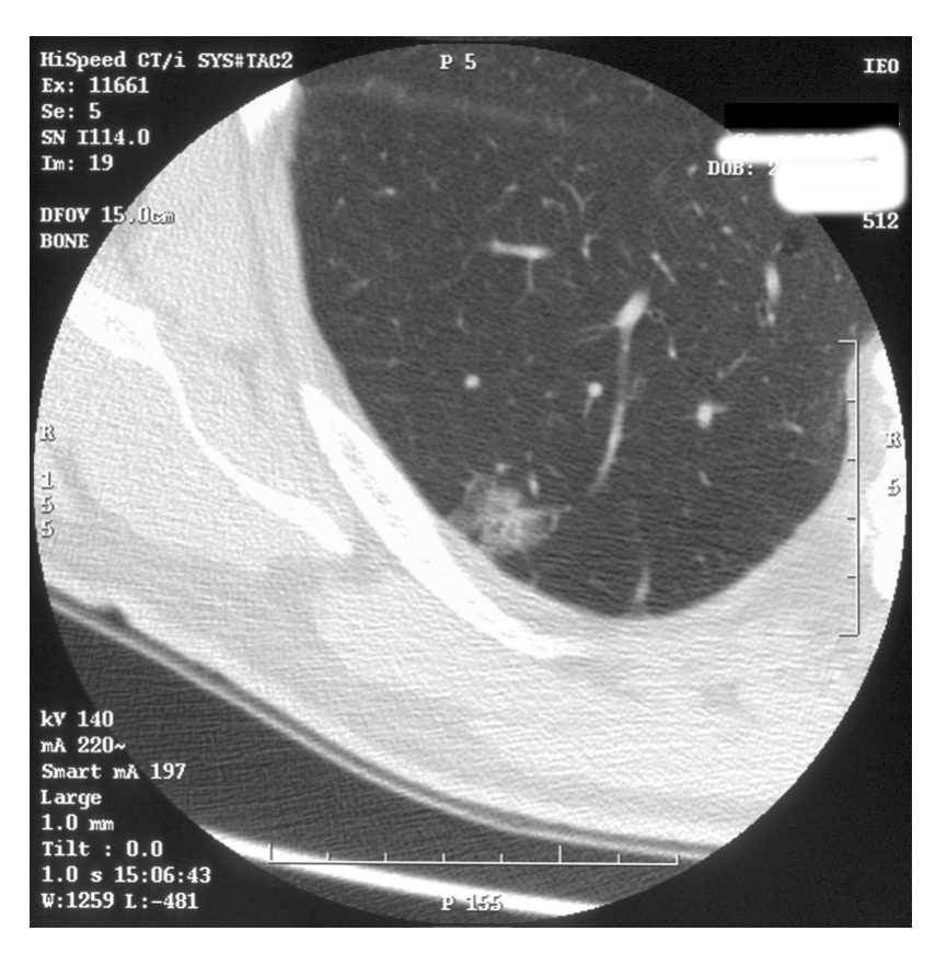
Figure 3: A semisolid nodule in the lower right lobe. This is an adenocarcinoma with a bronchioloalveolar component.

This is a semisolid nodule consisting of both ground-glass and solid soft-tissue attenuation components. It partially obscures the surronding parenchyma.