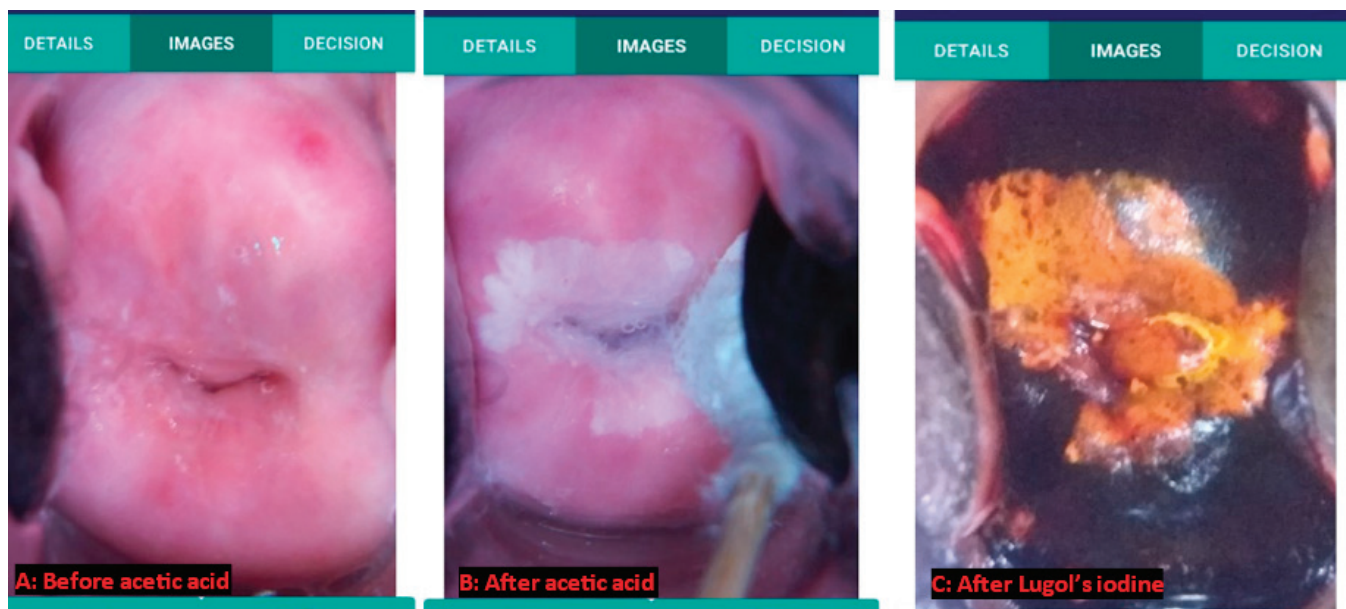
Figure 3. Case number 3, showing good correlation between cytology, colposcopy and histopathology. CareHPV – positive (for high-risk HPV); Pap – HSIL; Colposcopy – major change (dense acetowhitening); Histopathology – CIN III.